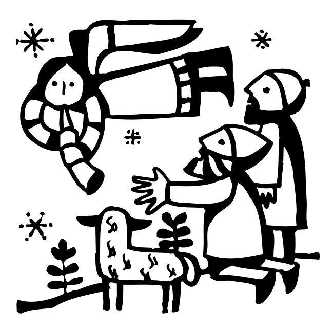
I come to proclaim good news to you

He rules the world with truth and grace and makes the nations prove the glories of his righteousness and wonders of his love, and wonders of his love, and wonders, and wonders of his love.